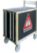
Order no.: 120308 Marking set mobile container