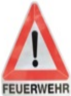
Order no.: 120310 Fire service warning sign