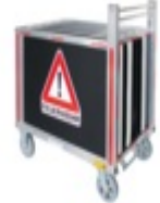
Order no.: 120309 Marking set mobile container